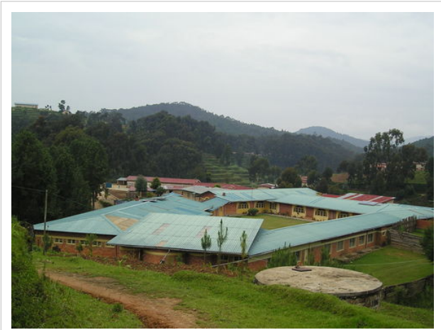
"Rugege" Health Center and Mission buildings, Gatare, Rwanda

For this purpose, the Organization promotes: